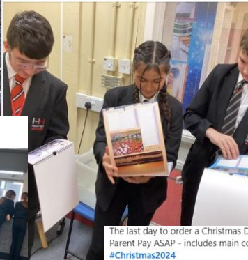
The last day to order a Christmas Dinner is Friday 22nd November - purchase on Parent Pay ASAP - includes main course, dessert, a drink and cracker - #Christmas2024