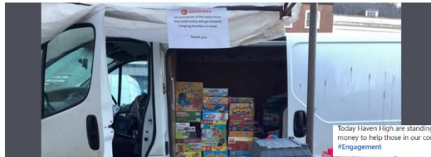
Today Haven High are standing on Boston Market UK - please do come and support us - raising money to help those in our community in need this christmas Boston Borough Council #Engagement